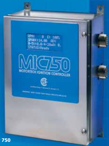
Ignition Controller 750