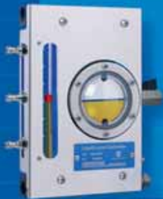
Liquid - level controller

Specialist accessories for stationary gas engines. These include lubricant level controllers, oil and air filters and catalytic converters.