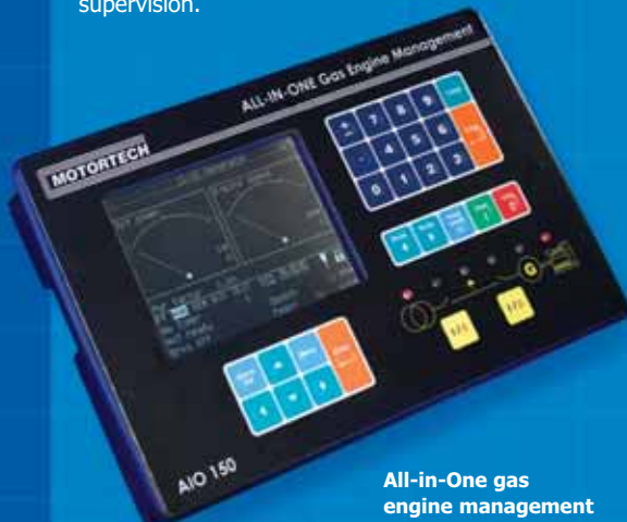
All-in-One gas engine management